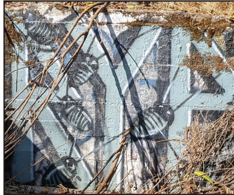
BUG ART ON A WALL