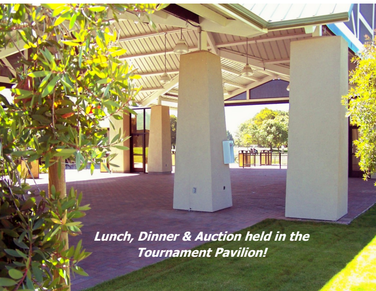
Lunch, Dinner & Auction held in the Tournament Pavilion!

Donate to our Live & Silent Auction! Call (510) 881-6731 for more info.!